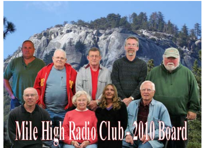
MHRC Board 2010

MHRC Board / Club / RACES: Thursday, January 14th, 6:30 PM All are welcome to attend any of the above meetings or call in on the nets.